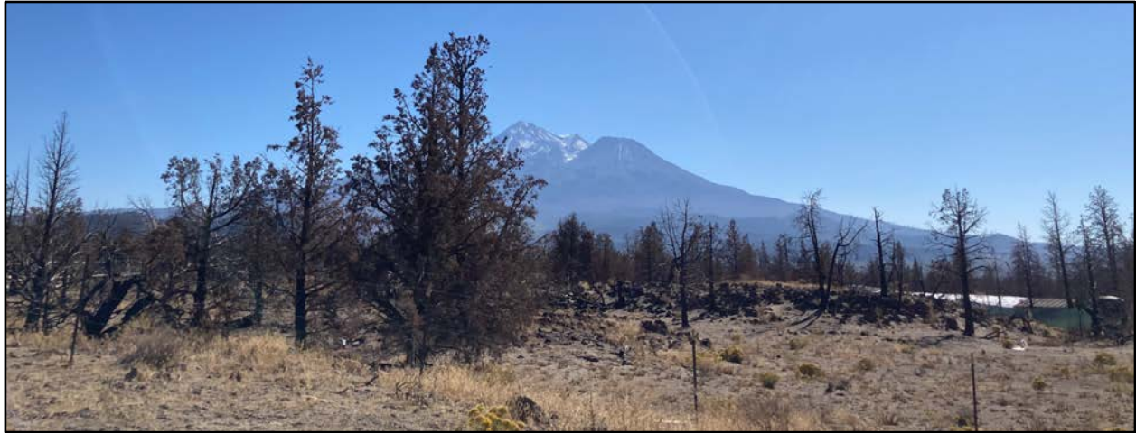
Illustration 3. Many Hmong American farmers in Siskiyou County live in drought and wildfire-vulnerable rural subdivisions that lack public services like paved roads, water, or electricity. This photo, taken in October 2022, shows a greenhouse and water tank re-built behind a rocky hill (lower right). Note the dead trees burned in the 2021 Lava Fire and Mount Shasta in the background.