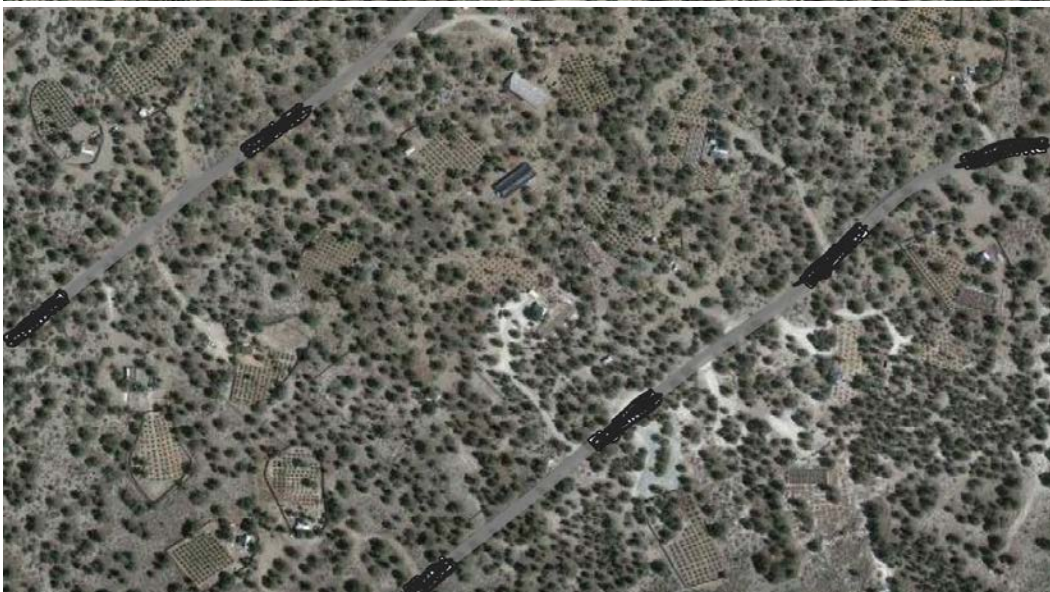
Figure 2. Images pulled from Google Maps of the same area of Siskiyou County in 2014, 2016, and 2022. Note the proliferation of cannabis cultivation sites, including after the 2017 local cultivation ban.

Portraying cannabis cultivation as environmentally polluting and requiring intervention is not new. Polson (2019) argues that enforcement and eradication efforts focused on environmental