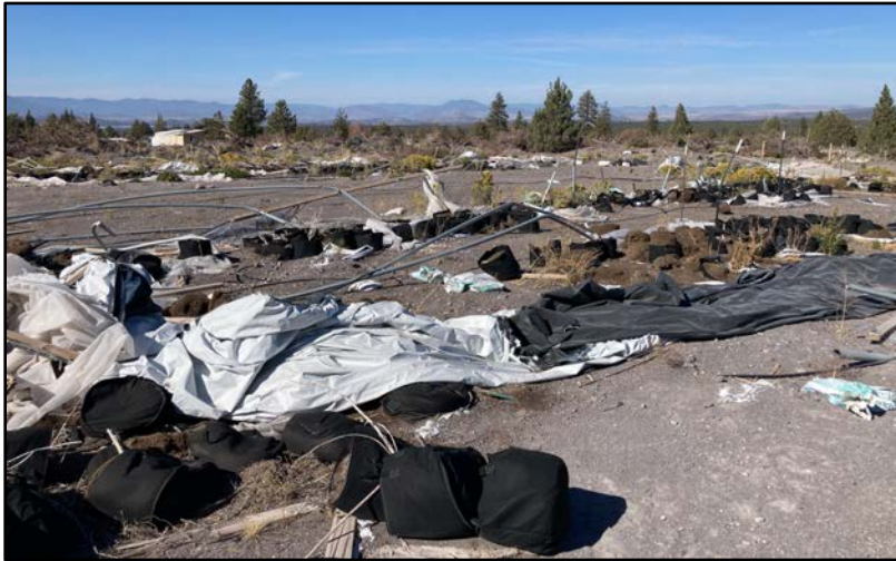
Figure 3. The site in Siskiyou County where Representative Doug LaMalfa (R-CA) participated in the bulldozing of greenhouses in July 2021. Photographed more than a year later, trash and debris had still not been removed. With public resources for law enforcement but not remediation, many sites, once raided, present further environmental risks.

(figure 3). These sites pose environmental risk as plastics and other trash can ensnare wildlife, smother native plants, and enter waterways. Additionally, inputs such as fertilizers and pesticides, once monitored by the people growing on that site, can be left exposed, or in containers punctured by law enforcement to render them unusable in the future, posing risks of soil and water contamination and wildlife poisoning.