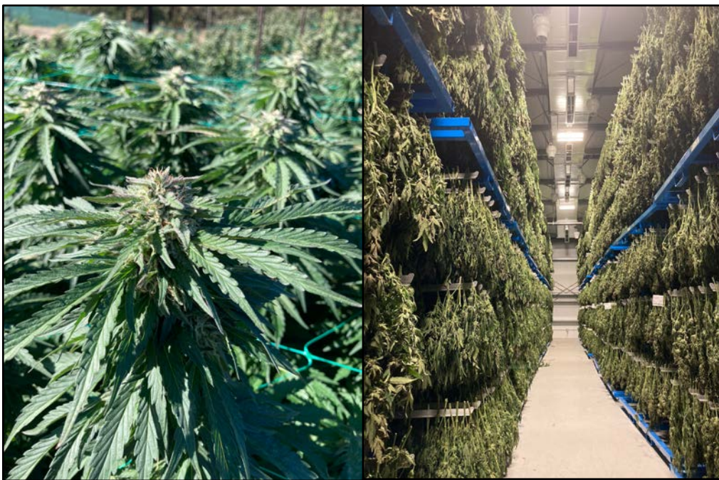
Illustration 1: California’s cannabis cultivation

Broadly, this research asks: What are the causes and effects, intended and unintended, of local cannabis cultivation bans? We conducted four in-depth case studies of “ban counties” in Siskiyou, San Bernardino, Yuba, and Napa Counties. We stratified and selected these counties for geographic, ecological, industry, land use, political dynamics, and socio-demographic diversity. Each county is home to incorporated cities that allow cannabis, and each county borders counties that permit cultivation, facilitating comparisons in ban/permit approaches. San Bernardino and Siskiyou Counties have taken a hardline law enforcement-led approach to cannabis cultivation enforcement, while Napa and Yuba Counties offer a comparison of a “softer” enforcement approach seated in code enforcement. Selection of these counties enables a comparison in the efficacy and impact of differing approaches in ban enforcement.