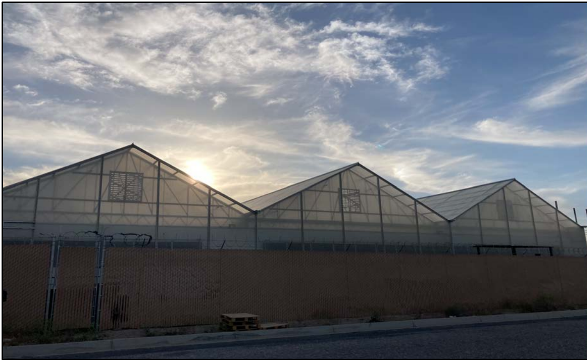
Illustration 4. Several cities in San Bernardino, such as Adelanto, have embraced permitted cannabis cultivation as a driver of economic development. Just over the city boundaries, greenhouses that contain cannabis have been a major target of the San Bernardino Sheriff Department's "Operation Hammer Strike," which raided approximately 9,000 greenhouses from September 2021 to November 2022. (Photo by Petersen-Rockney, 2022.)