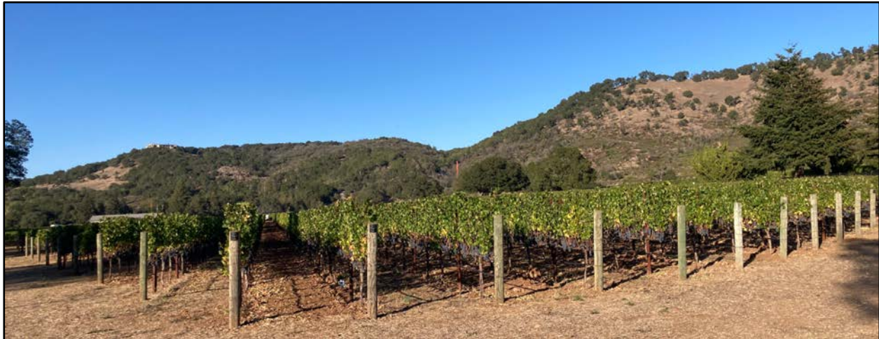
Illustration 5. Wine grapes dominate the landscape in Napa County. Wine growers, vintners, and others in the industry have worked to establish the Napa brand, which some worry cannabis would taint. Additionally, wine grapes are a pesticide, fungicide, and fertilizer-intensive crop. If permitted cannabis were allowed, pesticide drift could ruin cannabis farmers' crops, and threaten the ability of grape growers to spray chemicals.