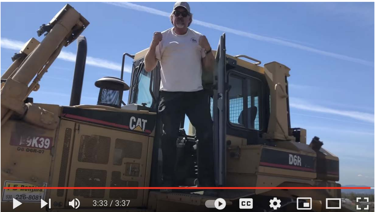
Illustration 2. Screenshots from Rep. Dough LaMalfa's video bulldozing a cannabis grow in Siskiyou County. Accessed from LaMalfa's website January 2024.